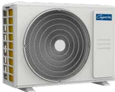
12,000 & 18,000 BTUH

1 Oil traps must be installed every 10 feet when outdoor unit is installed above indoor unit.