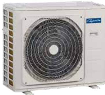
24,000, 30,000, 36,000 BTUH